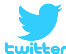
CORRELATION BETWEEN EEG ENGAGEMENT & TWITTER ACTIVITY